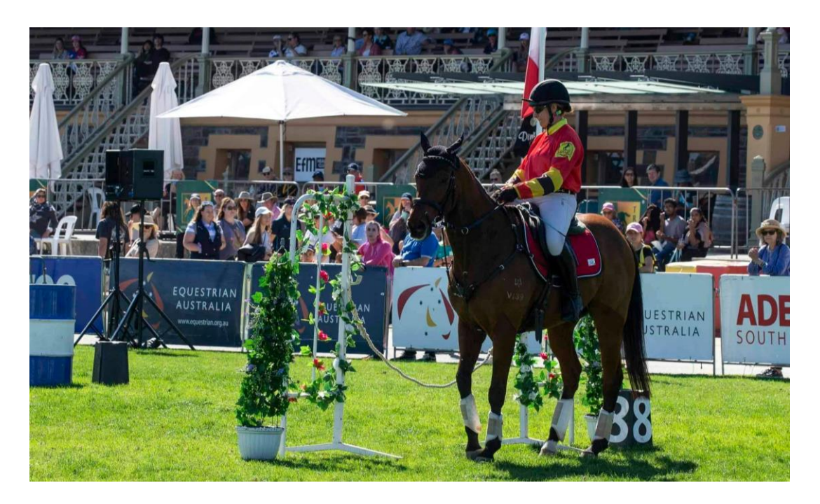
Handling the gate (top) and the rein back corridor (below)

We were honoured to have her accept the challenge & try her hand at Working Equitation.