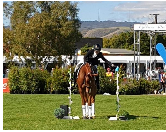
'Gabe' saluting the judge at the start line, then handling the first obstacle, the Switch Cup, with a calm, square halt.